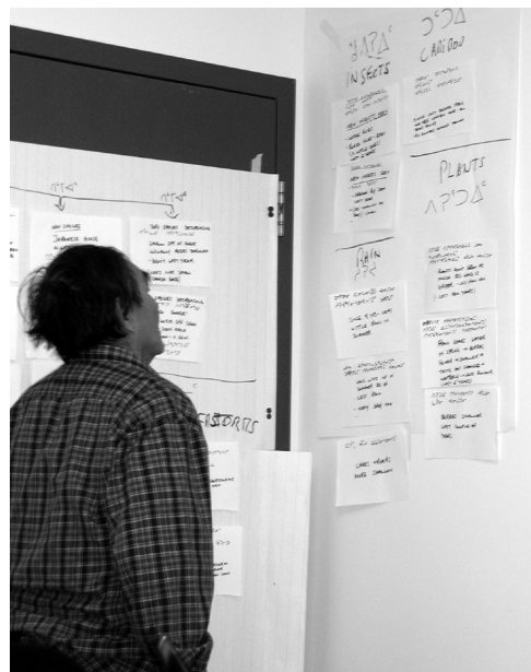
Figure 2: Nunavik participant reviewing observations on environmental change