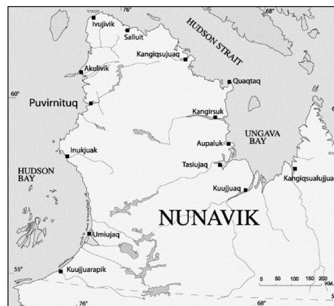
Figure 1: Map of Nunavik

In the past 30 years, and in the past decade in particular, Inuit have been confronted with very difficult challenges to the ways they interact with the environment. This report looks at the observed changes that are taking place in the region of Arctic Quebec (Nunavik, Canada), an area that covers 507,000 square kilometers and is comprised of 14 Inuit communities that lie along the coasts of Ungava Bay, the Hudson Strait and Hudson’s Bay, and the responses by the people living in these communities to these changes. This report represents a synthesis of information expressed at a series of community workshops held in three Nunavik communities during the period of 2002-2003. The workshops aimed at helping communities document their observations of environmental and climate change, the impacts these changes were having on aspects of Inuit community and individual life and what is already being done or could be done in response to these changes to minimize impacts and take advantage of whatever opportunities these changes may represent today and in the future.