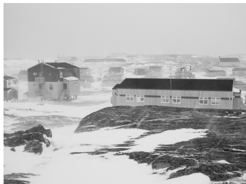
Figures 4 and 5: Images from the communities of Kangiqsuujuaq and Ivujivik