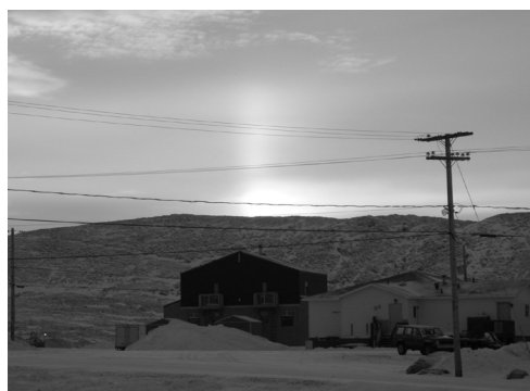
Figure 3: Sundog in the community of Kangiqsuujuaq

It may or may not yet be proven that some of the changes reported by the people of Nunavik are actual results of global warming, but even without scientific corroboration of their direct link to climate change, these observations are